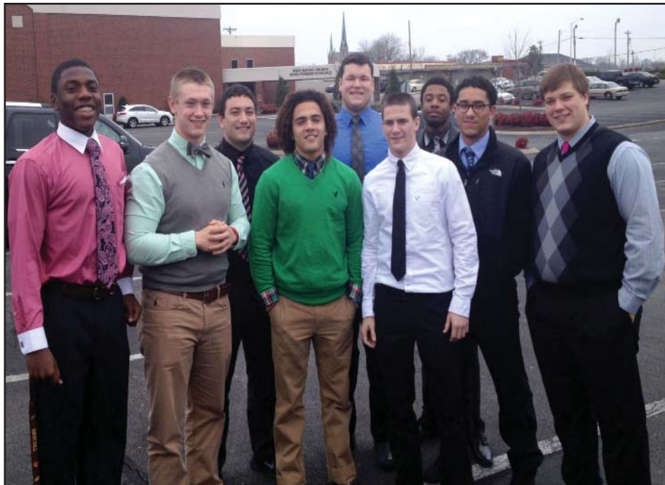
Members of the FCHS football team prepare to enter the Leaf Chronicle awards banquet. Eight players were named to the All-Area team